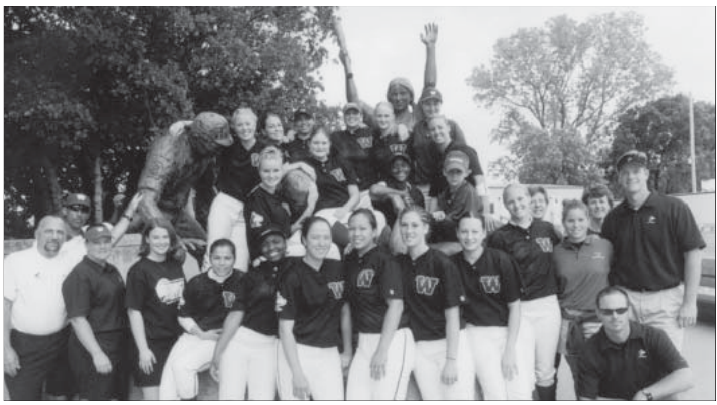
Washington made its sixth College World Series appearance in 2003.

PB - Team (12), Rivera 7, Hanson 5, Opp (5). Pickoffs - Team (8), Rivera 7, Hanson 1, Opp (5). SBA/ATT - Rivera (12-16), Bollinger (10-15), Boek (7-12), Hanson (5-11).